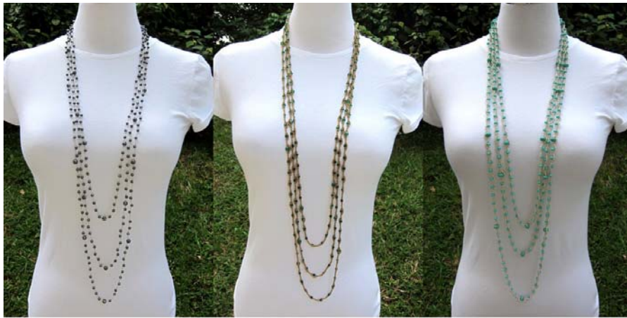
Original Black Pearls

Learn the basic spiral rope technique and turn them into contemporary 2 or 3 tiers long necklaces.